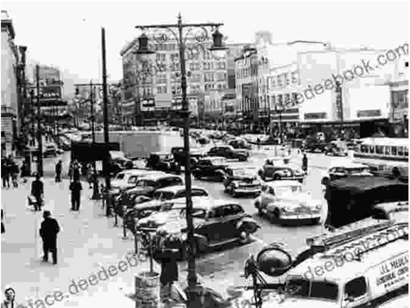
Shepperson's downtown during the height of its tourism boom

been neglected, underwent significant improvements, including the construction of modern roads, water systems, and electricity.