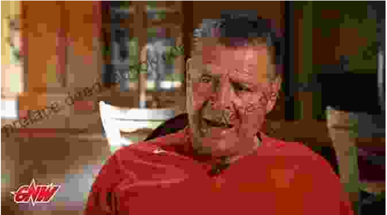
Ronnie Garvin later in his career