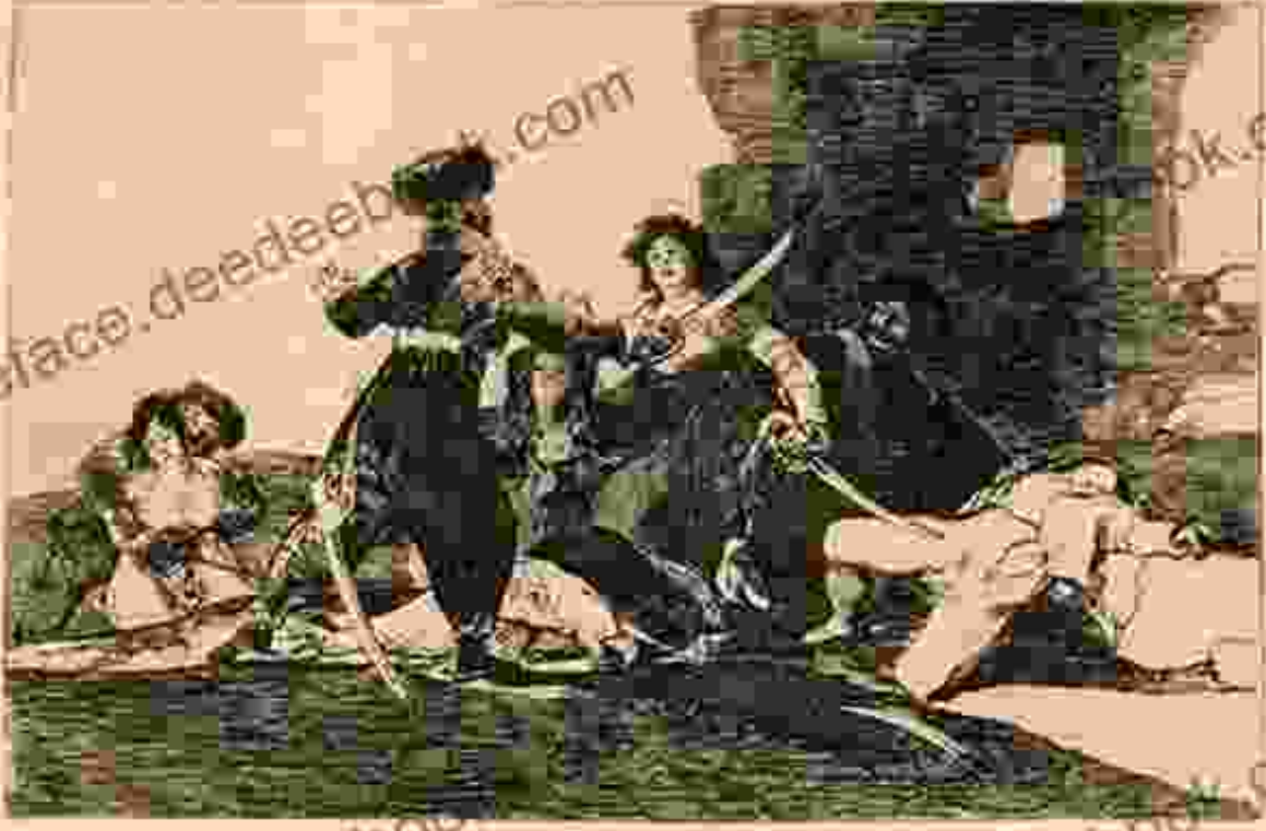
The Disasters of War, 1810-1814