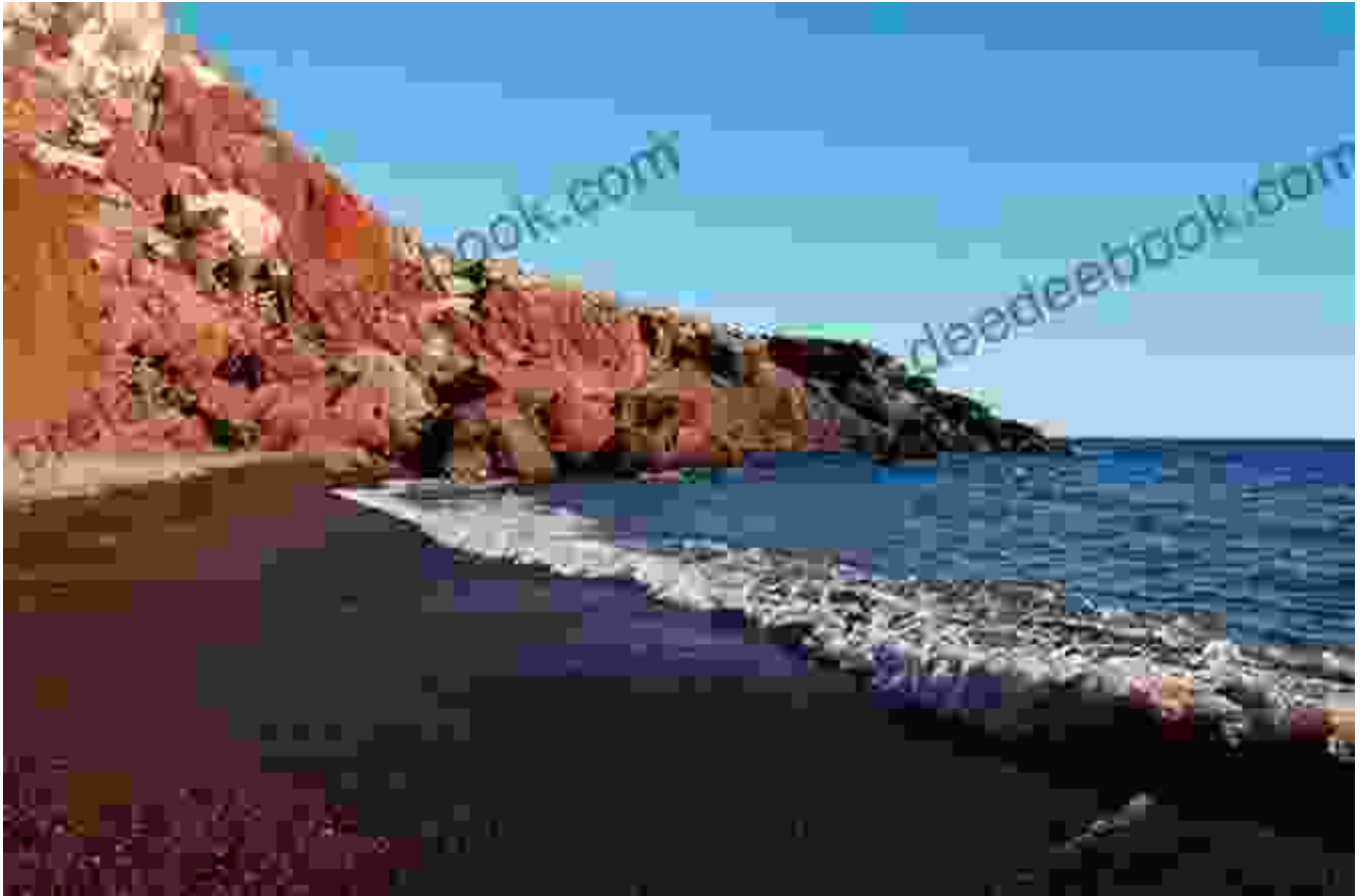
Red Beach, Santorini