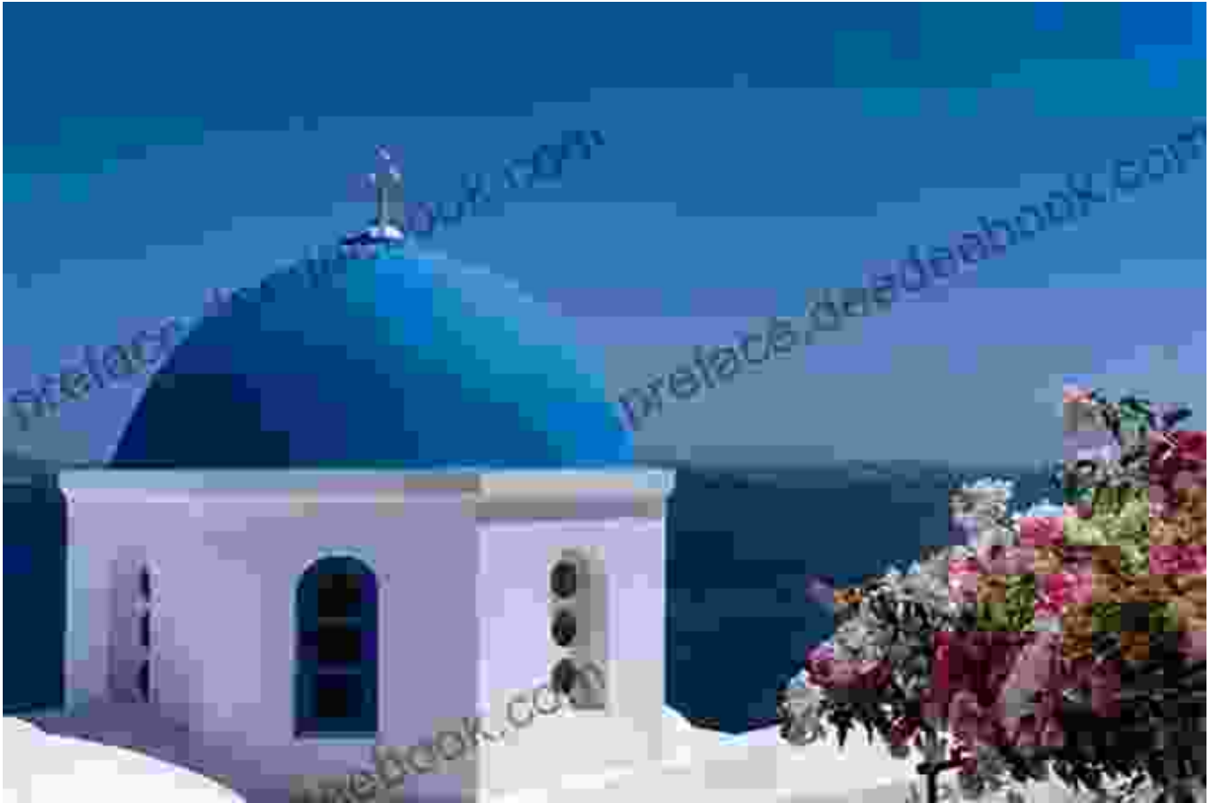
View of Fira, Santorini

Take a leisurely walk along the caldera rim, enjoying the stunning views and admiring the unique architecture of Fira. Stop by one of the many cafes and sip on a refreshing drink while soaking up the lively atmosphere.