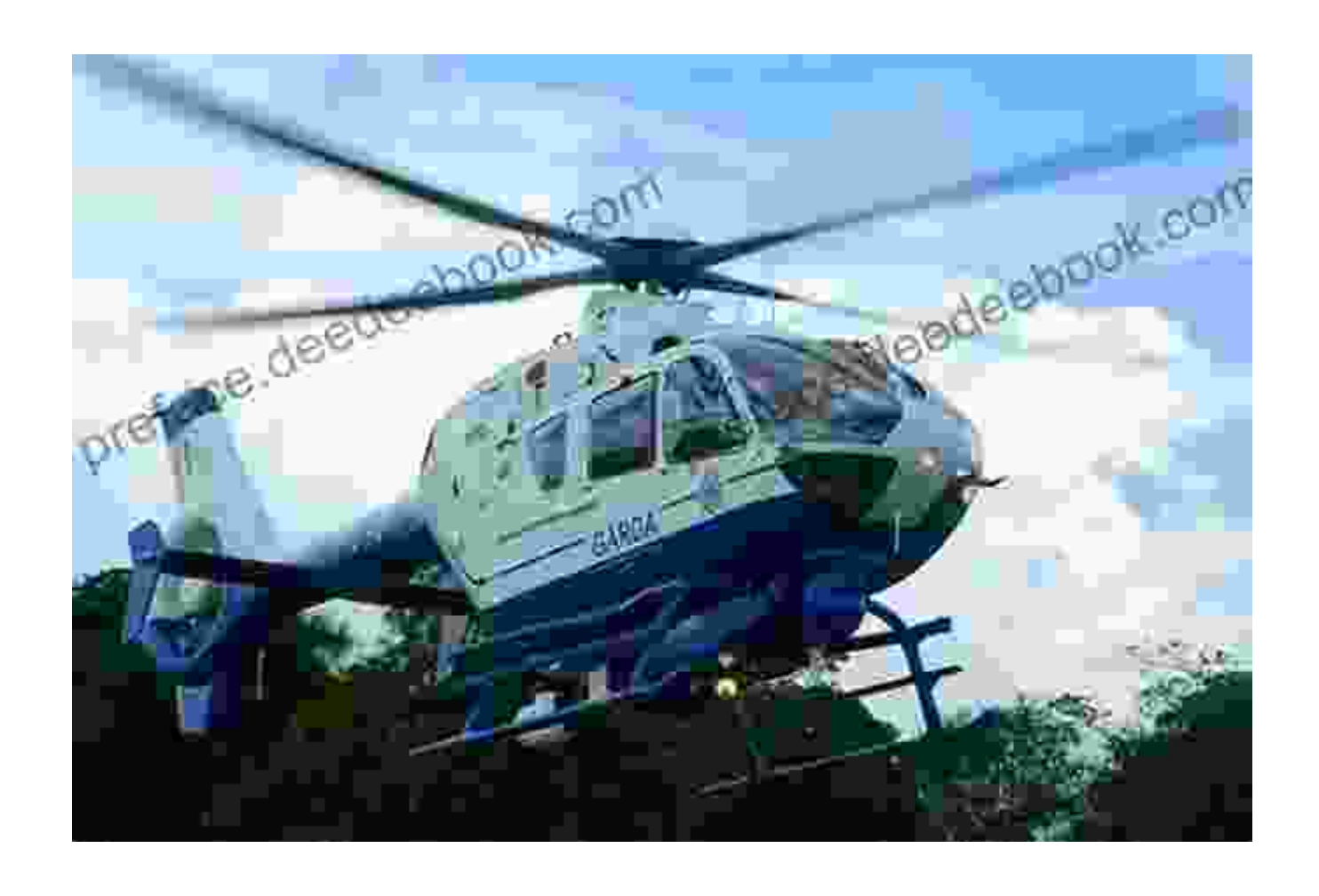
A Garda Air Support Unit helicopter