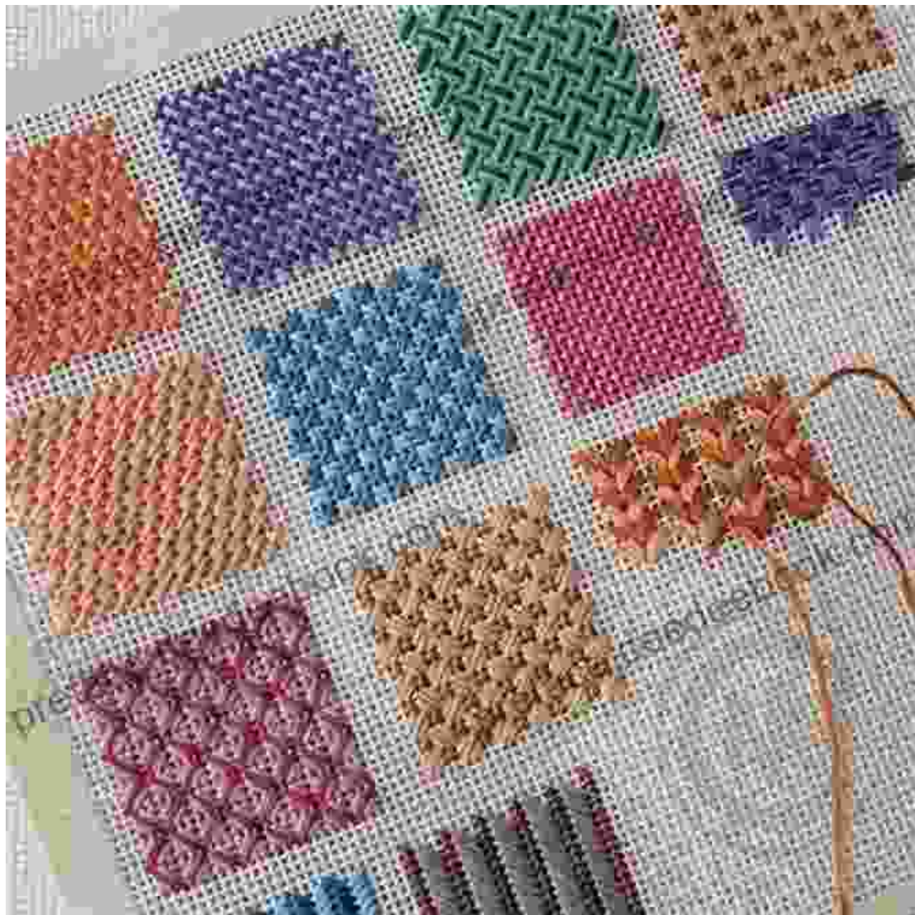
A cross stitch pattern featuring a geometric design.

Cross stitch patterns can be used to create a wide variety of designs, from simple motifs to elaborate landscapes. You can find cross stitch patterns in books, magazines, and online. You can also create your own cross stitch patterns using software or by hand.