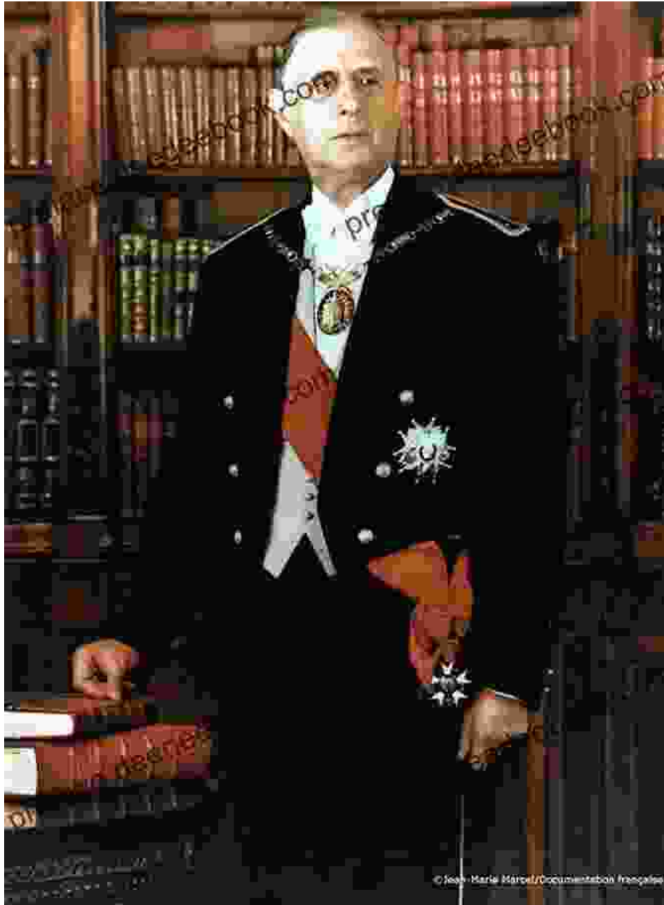
Charles De Gaulle as President of France

De Gaulle was a controversial figure, and his presidency was marked by both successes and failures. He was admired for his leadership during World War II and for his role in France's decolonization. However, he was also criticized for his authoritarian style of government and for his handling of the Algerian Crisis.